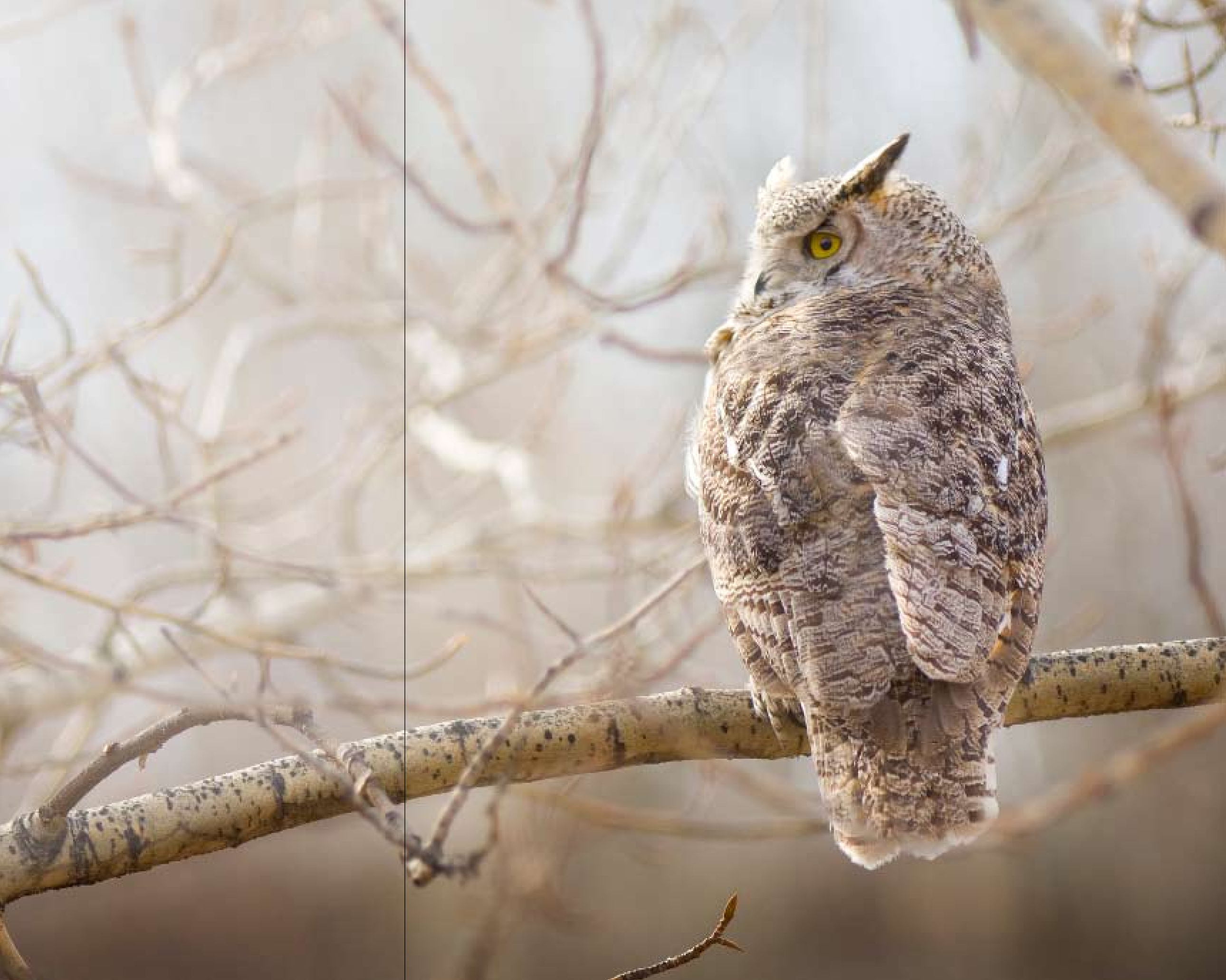
Above: A Bull moose in September along Highway 40 in the heart of K-Country. At right: A Great Horned Owl in early morning light surveys his territory.

Which is why Bragg Creek offers a selection of overnight accommodations, and for those of you who really want to connect with nature there are always multiple campsites a stone's throw from the Hamlet.